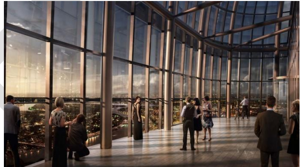
The St. Regis Belgrade