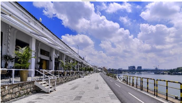
Sava River Promenade