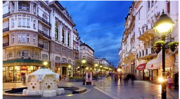
Knez Mihailova Street