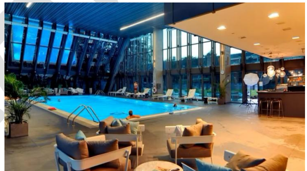
Crowne Plaza Belgrade