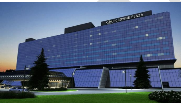
Crowne Plaza Belgrade