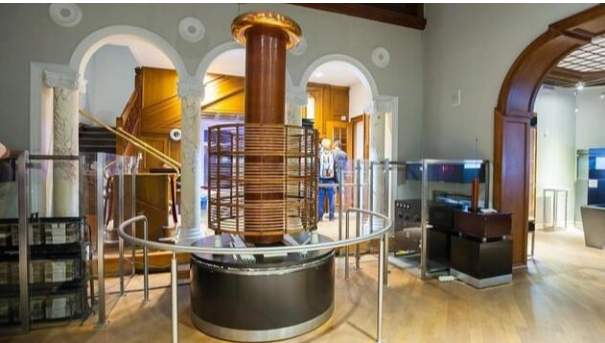
Nikola Tesla Museum