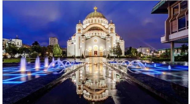
St. Sava Church